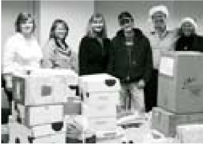
The week before Christmas, staff from Holland America Line arrived at New Beginnings' administrative office with a Gray Line bus filled with gifts for our residents and program participants! We thank them and all of the generous groups who helped in our "adopt-a-family" program.