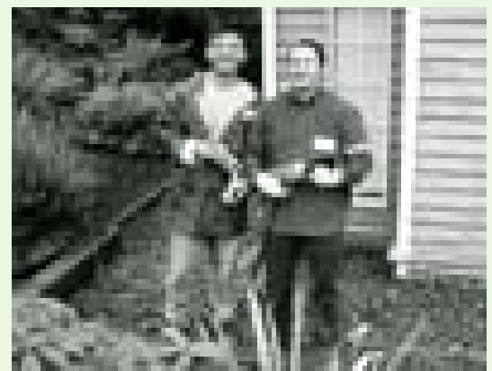
Two Microsoft employers at work at the Transitional Housing Program on United Way's Day of Caring.