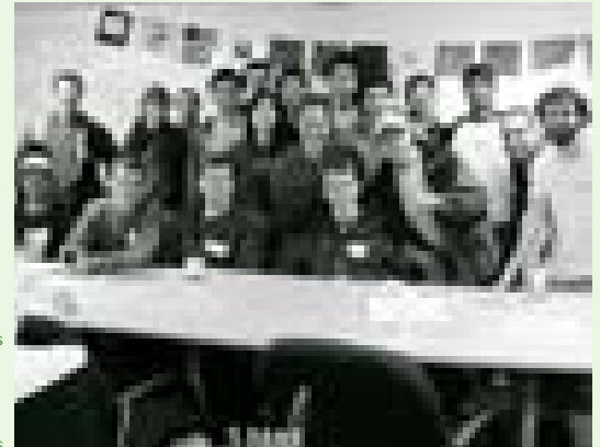
United Way's "Day of Caring" in September was a wonderful success, with teams of volunteers from Microsoft and Swedish Health Services sprucing up New Beginnings Emergency Shelter and Transitional Housing Programs. Over 50 volunteers spent the day painting, planting, and building.