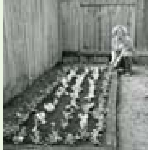
Emergency Shelter women's advocate Nikki Dally at work in the garden.